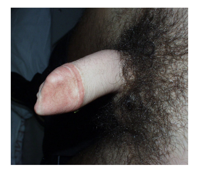
Fig. 2 – Unaesthetic outcome with two cylinders.

Of the 129 patients, 76 patients (58.9%) still have their original implant in place. Fifty-three patients (41.1%) needed to undergo either removal or revision, which is defined as a surgical replacement of a part of the original prosthesis or a replacement of a total prosthesis due to infection, erosion, dysfunction, or leak. A malposition of the prosthesis was corrected by surgical reposition of the prosthesis so that the original implant could remain in place and, thus, is not counted as removal or revision. Of 185 prostheses used in 129 patients, 108 (58.4%) still remain in place, with a total infection rate of 11.9% (22 prostheses), a total protrusion rate of 8.1% (15), a total prosthesis leak rate of 9.2% (17), a total dysfunction rate of 13% (24), and a total malposition rate of 14.6% (27) (Table 4, Fig. 3).